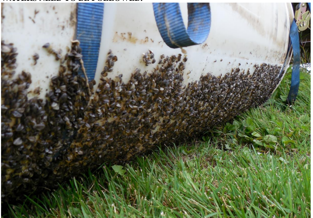
A dock float removed from Little Sand Lake last fall shows how the population is expanding.

conducting genetic(DNA) research to try and determine which water body was the source of the mussels found in Sand Lake. They are also exploring technology for management or control of zebra mussels, but at this time there is no affordable method that can be used in lakes. WE MUST ALL TAKE ACTION TO AVOID MOVING THESE INVASIVE SPECIES TO OUR LAKES. RULES THAT ARE IN PLACE REGARDING MOVING A BOAT FROM INFESTED WATERS NEED TO BE FOLLOWED.