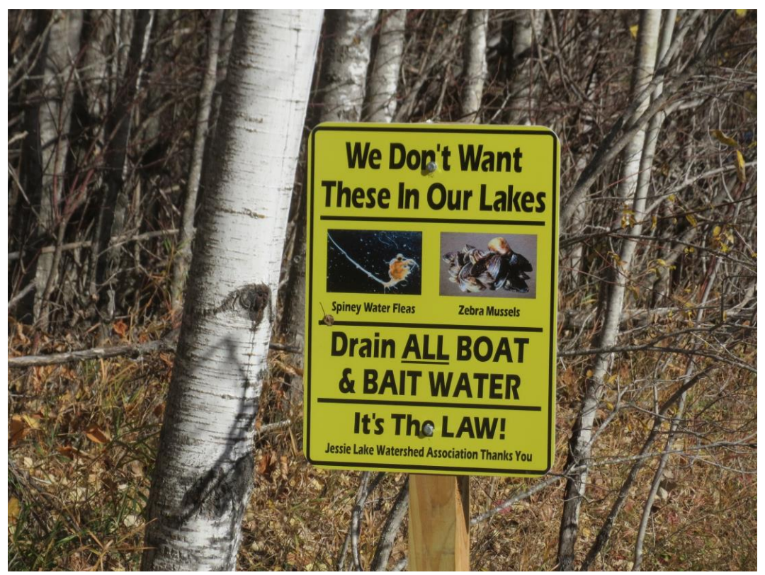
New AIS sign at Little Jessie public access installed by JLWA last fall.