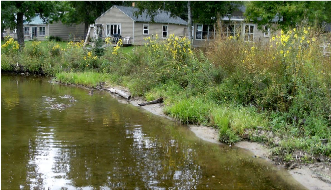
Rising Eagle Resort Project Receiving Shoreland Stewardship Award