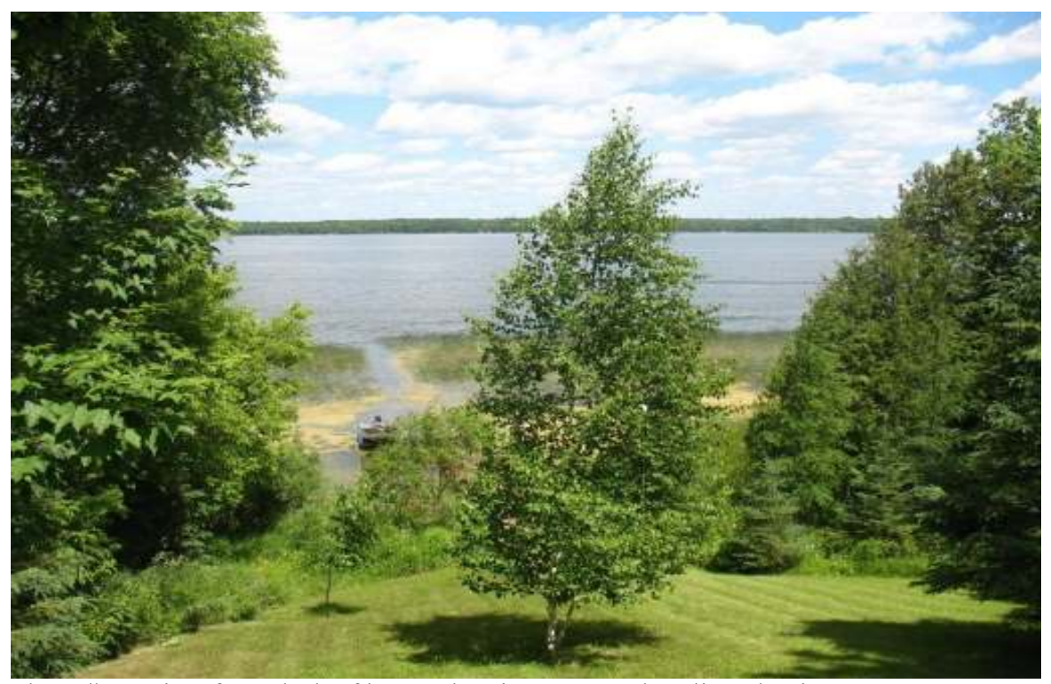
Photo #3 – View from deck of house showing mature shoreline planting.