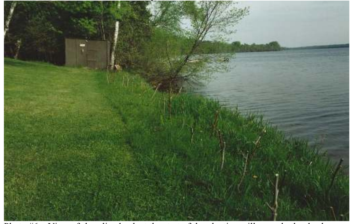
Photo #6 – View of shoreline bank at the start of the planting willow and other bushes.