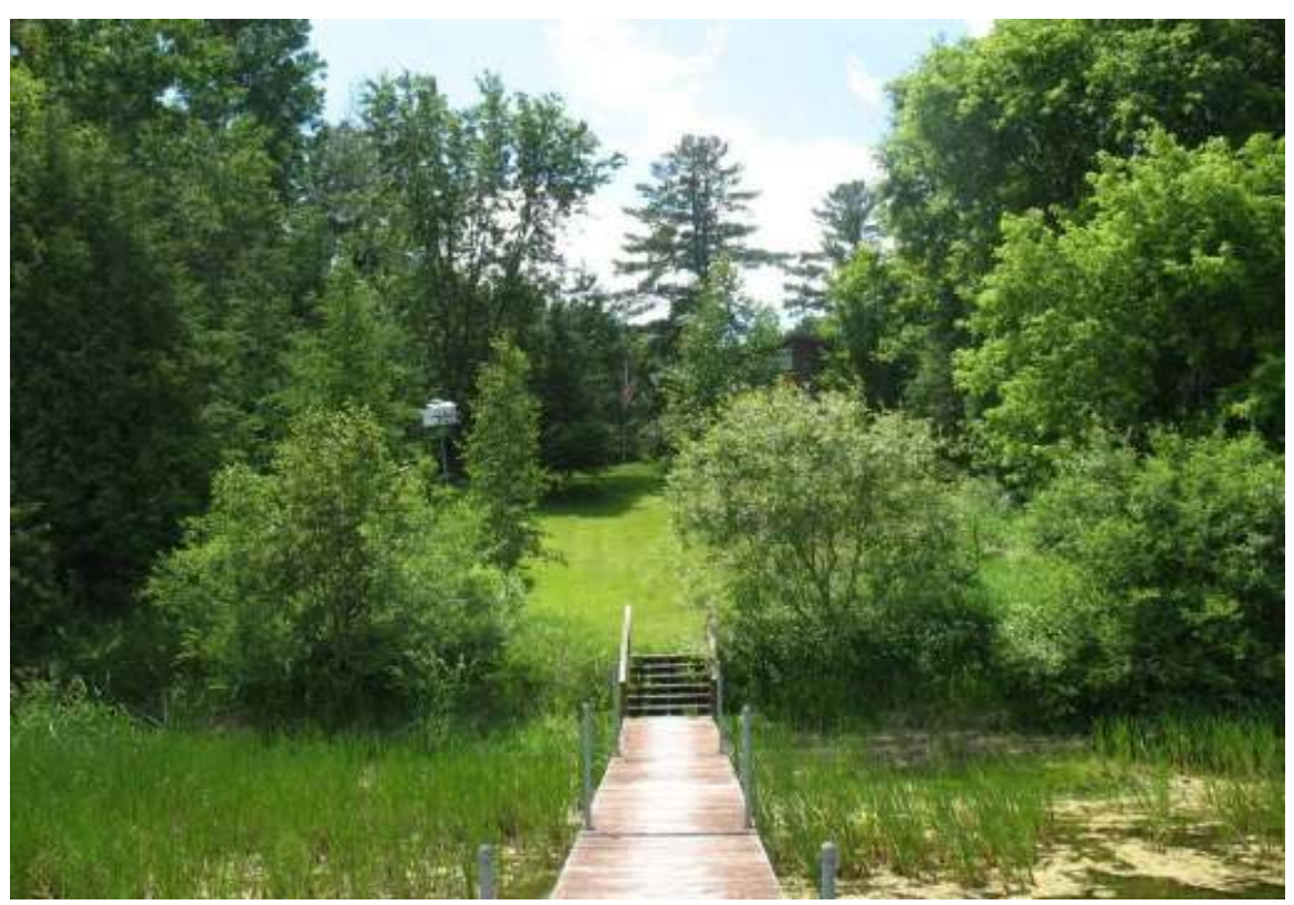
Photo # 1 – View from dock of mature restored shoreline at Nelson's