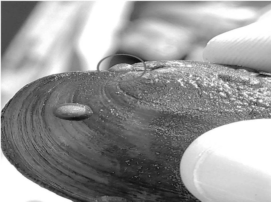
Photo-A juvenile Zebra Mussel attached to a native mussel in Jessie Lake. The photo represents the average size of Zebra Mussels found in Jessie Lake in October, 2023.

Jessie Lake 2023 – Jessie Lake is now confirmed to be one of the most recent lakes in Itasca County to have Zebra Mussels. In mid-October, a property owner had reported Zebra Mussels on a pontoon being removed from Jessie Lake for the season. This prompted staff from the Itasca SWCD AIS Program to further examine other docks, boat lifts and watercraft that had been pulled out of the lake and it was found that the mussel population, although sparse, appears to be present throughout the lake. The Zebra Mussels found were mostly juvenile, 1-2 years old, and were few and far-between.